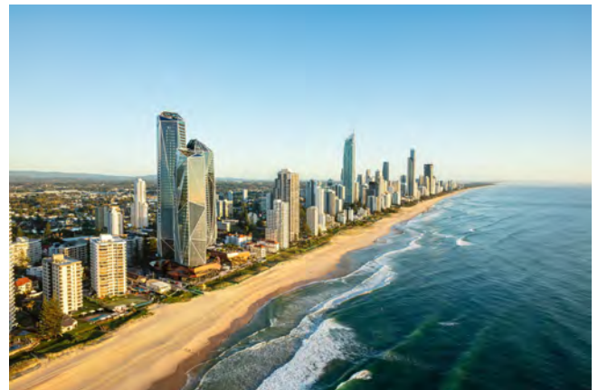
IMAGE: QUEENSLAND'S GOLD COAST