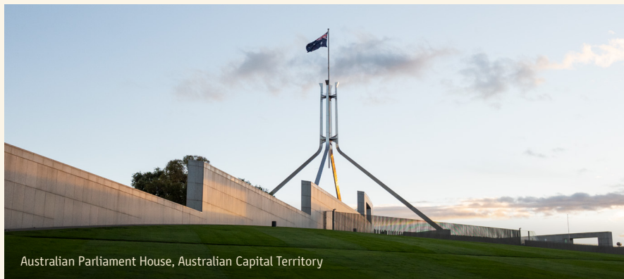
Australian Parliament House, Australian Capital Territory

- Indian life insurance company incentive