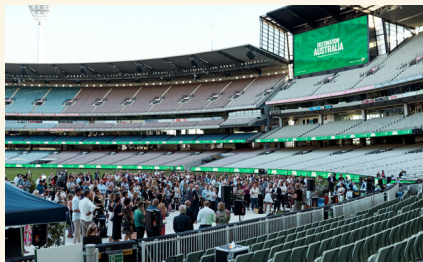
Visit the Australian Sports Museum and step onto the hallowed turf of the Melbourne Cricket Ground .