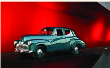
Discover 'Big Histories' at The National Museum of Australia in Canberra which include a prototype of Australia's first Holden car.