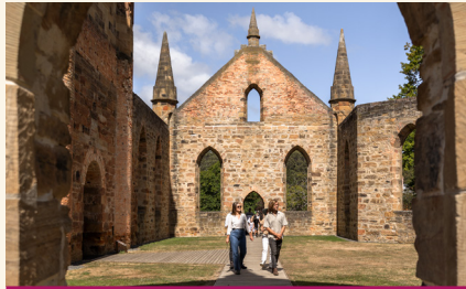
Gain fascinating conservation and penal colony insights behind bars at Tasmania's Port Arthur Historic Site .