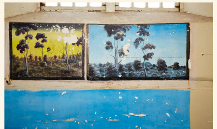
Embark on a fascinating guided tour of World Heritage-listed Fremantle Prison , the largest convict-built structure in Australia, and view exceptional prison art on its walls