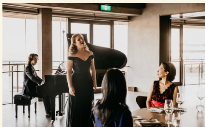
Experience exclusive access to the Sydney Opera House and enjoy your own private opera recital.