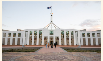
Visit Parliament House in Canberra for an exclusive behind-closed-doors tour of the seat of Australia's Federal Government – access rarely granted world-wide.