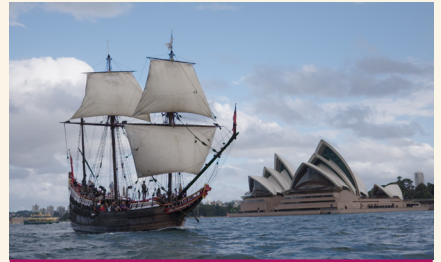
Cruise on Sydney Harbour aboard the Duyfken , one of the rarest replica ships in the world, from the Australian National Maritime Museum .