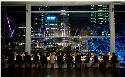
Experience the meaningful 'First Nations Exceptional Indigenous Art & Dining Experience' in Brisbane at the Queensland Art Gallery | Gallery of Modern Art .